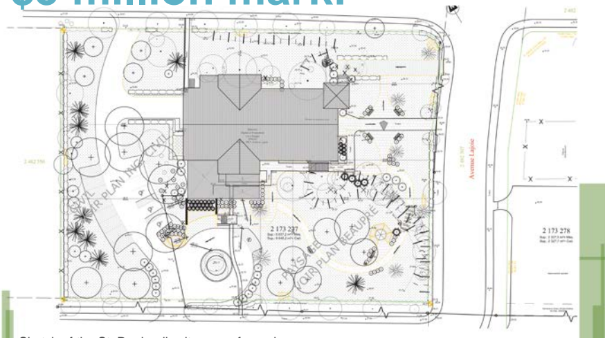
Sketch of the St. Raphael's site, seen from above

THANKS TO THE GENEROSITY OF OUR DONORS SO FAR, WE HAVE SURPASSED THE 50% MARK IN OUR $10 MILLION MAJOR FUNDRAISING CAMPAIGN.